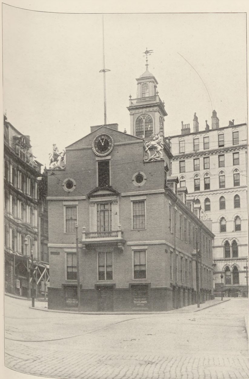
OLD STATE HOUSE, WASHINGTON AND STATE STREETS.