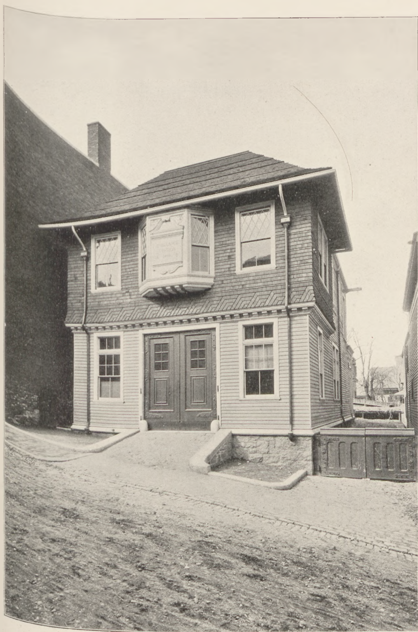
AMBULANCE STATION, NATIONAL STREET, SOUTH BOSTON. — Opened May, 1900.