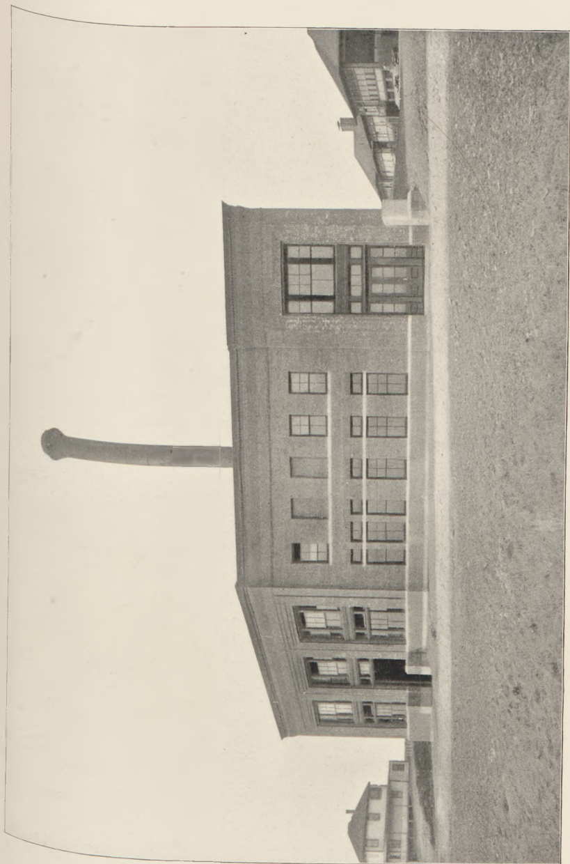
POWER-HOUSE ERECTED AT LONG ISLAND.